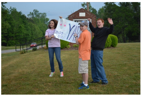
cess of this event.

Conference Youth Events Breakaway – June 18 th – 23 rd ACS – July 16 th – 21 st Pilgrimage Nov 9 th – 11 th – We will again go and again camp!