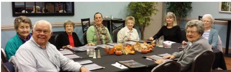
Senior Circle enjoying lunch in Clarksville

Tradition helps us remember and as we immerse ourselves in the rich traditions of the Advent season we re-member as the body of Christ. At Plank Chapel we have a few of my favorite Advent traditions. It begins the 29th of November with the Hanging of the Greens, telling why we decorate our sanctuary during this season. Then we have the mailbox in the back of the church so that we can share Christmas greetings with one another. Make or buy your cards, write notes of thanksgiving and place them in the box for pick up after worship.