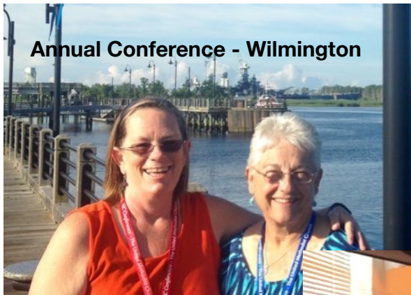
Annual Conference - Wilmington

Annual Conference, Breakaway, Vacation Bible School saw the people of Plank Chapel in Wilmington, Louisburg, and Kittrell. We worshipped together with adults, youth, and children from all over the North Carolina Conference! Thank you to all who participated!