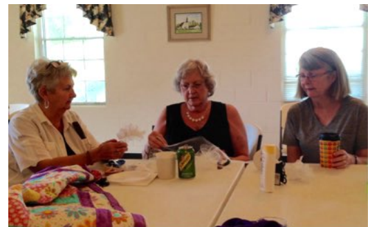
Teaching Bow Making at 4 Seasons

Thursday Night Crafters will be working on projects on July 14. It is a group of women who create amazing works of art to share with those they love or are in need.