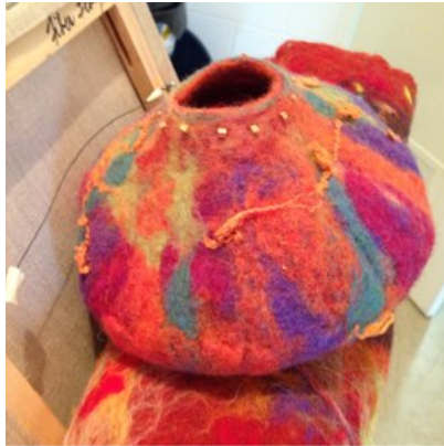
Felt Art at Senior Circle

Senior Circle will have a Hot Dog luncheon after a time of fellowship and fun on July 20.