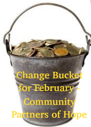
Change Bucket for February - Community Partners of Hope