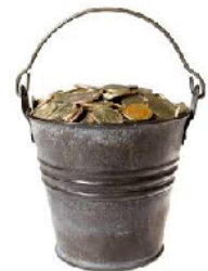
Change Bucket for March - Community Partners of Hope

Shelter Supervision: In March there are ample opportunities to be a volunteer supervisor at the Men's shelter.