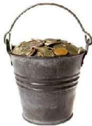
Change Bucket for May - Community Partners of Hope