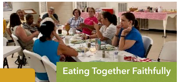
Eating Together Faithfully

The Gathering Place Wednesday September 5 10 am