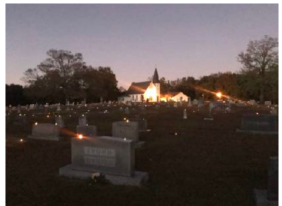
Remember those who's light shown brightly