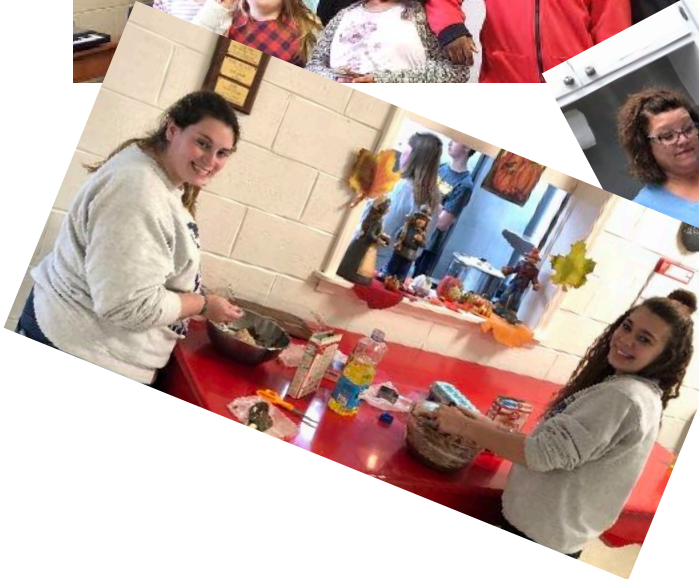
BASIC UMYF - Shelter Meal