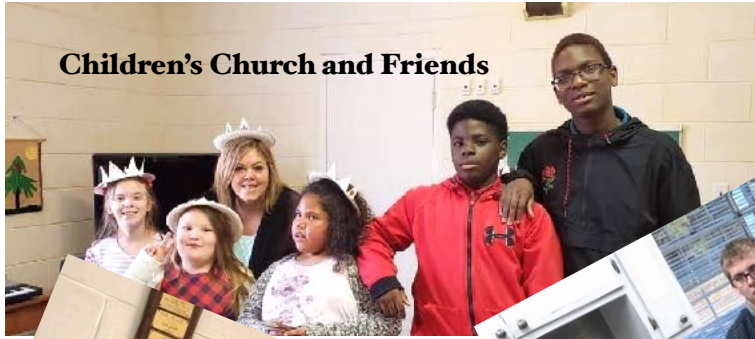
Children's Church and Friends