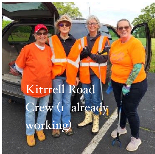
Kitrell Road Crew (r already working)