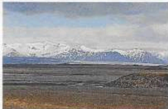
4,145 NAMED MOUNTAINS INCLUDING SNOWCAPPED PEAKS AND GLACIER CAPPED VOLCANOES

The population of the country is 376,500 with 63% living in the capital region around Keykjavik which is about 105 square miles. Iceland's entire population is about the same as the city of Los Angeles. The entire country is about the same size as Kentucky or Virginia. It is said you can drive across the country in roughly 17 hours. Known for its many natural wonders, tourism has become the number one industry in recent years replacing the fishing industry. ICELAND IS SO UNIQUE. THE PICTURES SAY IT BETTER THAN WORDS.