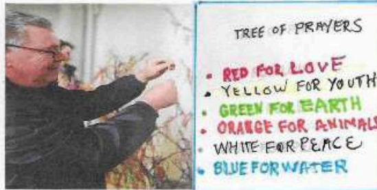
TREE OF PRAYERS MADE WITH YARN